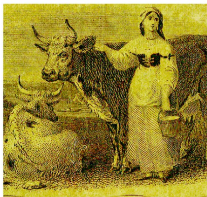
THIS MILKMAID appears on an 1863 $1 note issued by the Bank of Orange County in Goshen, New York.

On the $50 Legal Tender note of 1874, Liberty is dressed as Columbia. On other notes, she is shown