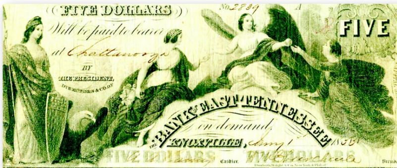
▼ LIBERTY IS SHOWN supervising three women on this $5 note of the Bank of East Tennessee in Knoxville. Not Actual Size

Washington Monument (which had finally been dedicated in 1885) and the Capitol—and presumably telling the narratives behind them, including the story of the U.S. Constitution, which appears at right.