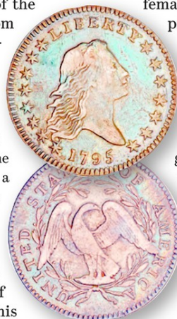
◀ THE 1795 FLOWING HAIR silver dollar helped create a national American identity. Actual Size: 39-40mm

In the late 19th century, the validity of the female form as a symbol of the nation was profoundly questioned. "What is it that we have the ugliest money of all civilized nations?" Galaxy magazine provocatively asked in June 1876. The contemptuous diatribe insinuated that American coins did not even look like money. The reason given was that stamped on the silver dollar was a likeness of Liberty—a muscular woman in a seated position, with a shield resting at her right side and a cap and pole in her