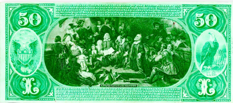
▲ THIS ORIGINAL SERIES $50 NATIONAL BANK NOTE (1863-75) highlights the morality of early female settlers in its “Landing of the Pilgrims” vignette.

What these representations of women also show is that those who so frequently appeared on the country’s currency were at long last beginning to achieve the means of earning money and spending it. At least some of them were, for most women in antebellum America were still employed in that oldest form of female labor: motherhood. Indeed, images of mothers graced a large number of notes. They always were shown engaged in nurturing, protecting, educating—apt symbols of creation, including the creation of wealth. Of course, that was also the manner by which those in power could keep women within safe, traditional roles. At times, the quality of the imagery was that of mushy treacle, as on a note from Medford, New Jersey, which features a seated woman tenderly cradling her