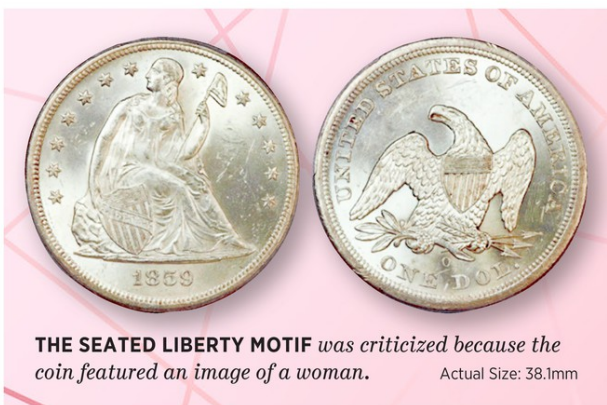
THE SEATED LIBERTY MOTIF was criticized because the coin featured an image of a woman. Actual Size: 38.1mm