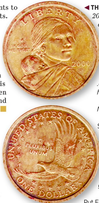
◀ THE SACAGAWEA $1 , first minted in 2000, never caught on with the public, despite the U.S. Mint's massive marketing campaign. Actual Size: 26.5mm

Rappeport, Alan. "See a Design of the Harriet Tubman $20 Bill That Mnuchin Delayed." The New York Times (June 14, 2019). nytimes.com/2019/06/14/us/politics/harriet-tubman-bill.html .