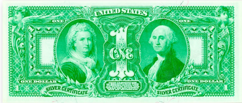
▲ MARTHA WASHINGTON appears to the left of George on the back of this $1 Silver Certificate of 1896. Not Actual Size