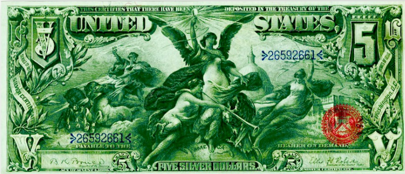
▲ AN ALLEGORICAL HISTORY instructs Youth on this 1896 $1 Silver Certificate (top). Some banks in Boston refused to accept this 1896 $5 Silver Certificate because of the scantily clad women depicted in the vignette "Electricity Presenting Light to the World." Not Actual Size

role was out of proportion to the coin's commercial success.