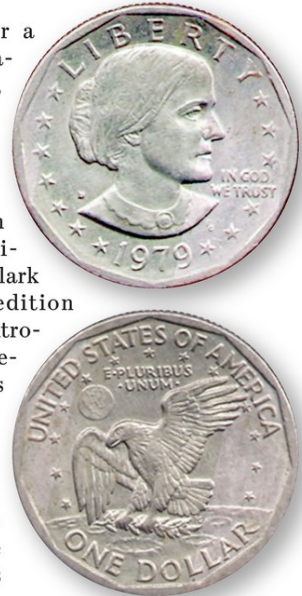
▲ SUSAN B. ANTHONY dollar coins were not popular with American citizens. Actual Size: 26.5mm

The Sacagawea dollar did not fare much better than its predecessor despite a massive marketing effort. The advertising campaign, which cost taxpayers some $67.1 million, did nothing to lift coin usage above about one percent of dollar transactions. People “just aren’t buying the idea,” an article in the Sacramento Bee noted in its headline. The disappointing news reached the upper echelons of President Bill Clinton’s administration, prompting the General Accounting Office to recommend that no more money be spent on marketing the Sacagawea dollar. The government could have saved upward of $500 million annually (mostly on the production and shipping of bank notes on account of the coins’ greater durability) had the public response to the Sacagawea dollars been more positive. According to the Federal Reserve, current production costs for the $1 and $2 denomination are at 5.5 cents per note. Higher-denomination notes are more expensive to produce because of additional security fea-