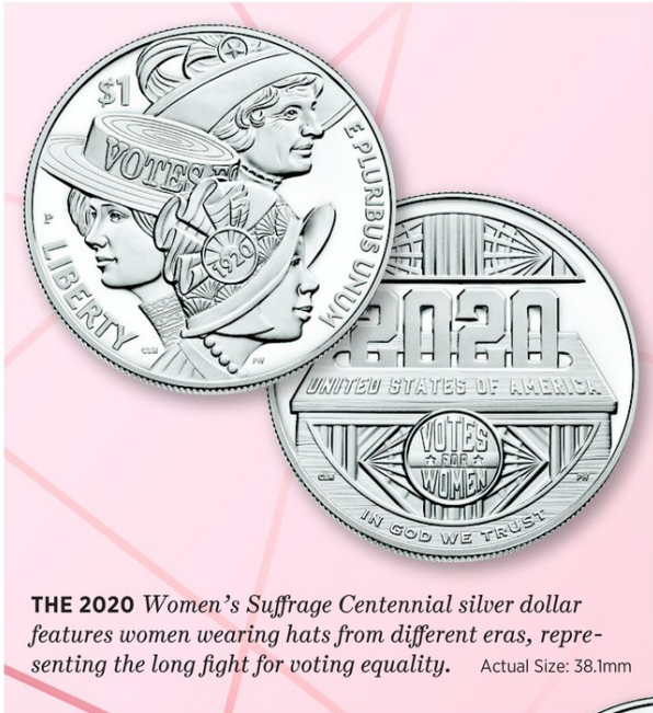
THE 2020 Women’s Suffrage Centennial silver dollar features women wearing hats from different eras, representing the long fight for voting equality. Actual Size: 38.1mm