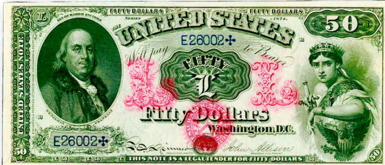
◀ LIBERTY IS DRESSED as Columbia on this 1874 Legal Tender $50 note. Not Actual Size

to the newly emerging financial institutions and instruments; the figures also served as a means to cope with or even conceal economic and social instability. Additionally, classical and allegorical images were reminiscent of coins that had always featured such figures. The notes therefore evoked an